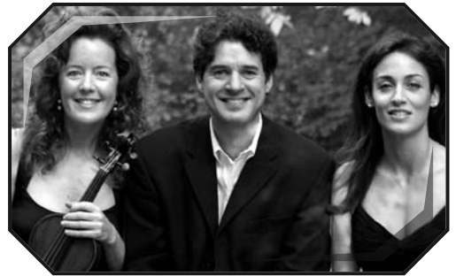
THE LINCOLN TRIO

finale. The eventual triumph over fate and adversity was first expressed musically by Beethoven’s Fifth Symphony, and Tchaikovsky’s Fourth is directly modeled on the Beethoven symphony, which Tchaikovsky explained in a letter to the composer Taneyev. The finale of Tchaikovsky’s Fourth is among the most exhilarating in the repertoire, and is sure to provide a celebration to remember for our 65th season! 🎪