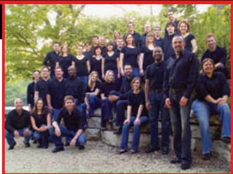
Chicago Chamber Choir

The superb Chicago Chamber Choir joins the ESO in a masterpiece of the choral literature, Morten Lauridsen's Lux Aeterna (Eternal Light) , which combines Renaissance style with lush Romanticism. Theofanidis' Rainbow Body , winner of the U.K. Masterprize, uses a large orchestra to expand a medieval chant into a musical rainbow, and favorites by Sibelius and Smetana complete this transcendent program.